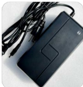
1. Take out the battery charger.

Always charge your battery in temperatures between 32°F - 104°F (0°C - 40°C ) and ensure the battery and charger are not damaged before initiating charge. If you notice anything unusual while charging, please discontinue charging and using the bike and contact ALWAYS Bikes Product Support for help.