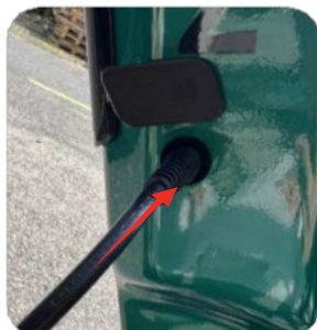
2. Charger hole in on the left side of the frame and near the folde.