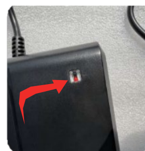
4. Red light shows the battery is charging, green light is full.