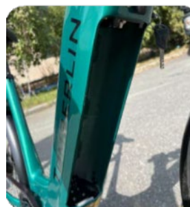
3. After taking out the