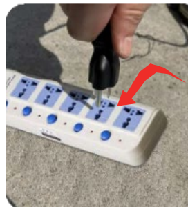
3. Plug the charger into power supply.