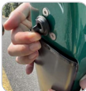
2. Take out the battery –