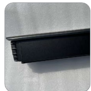
4. Removed battery.