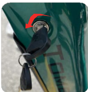
1. Open the battery key.